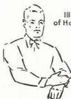
Illegal use of Hands or Arms