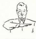
Illegal Motion or Formation at Snap