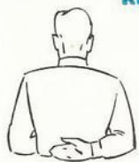
Illegal Forward Pass