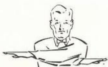
Penalty Refused, Incomplete Pass, Missed Goal, etc.